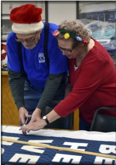
Scandia Marines Lions cutting fabric and tying blankets. The blanket tying occurred during a Dec. 11 breakfast with Santa.