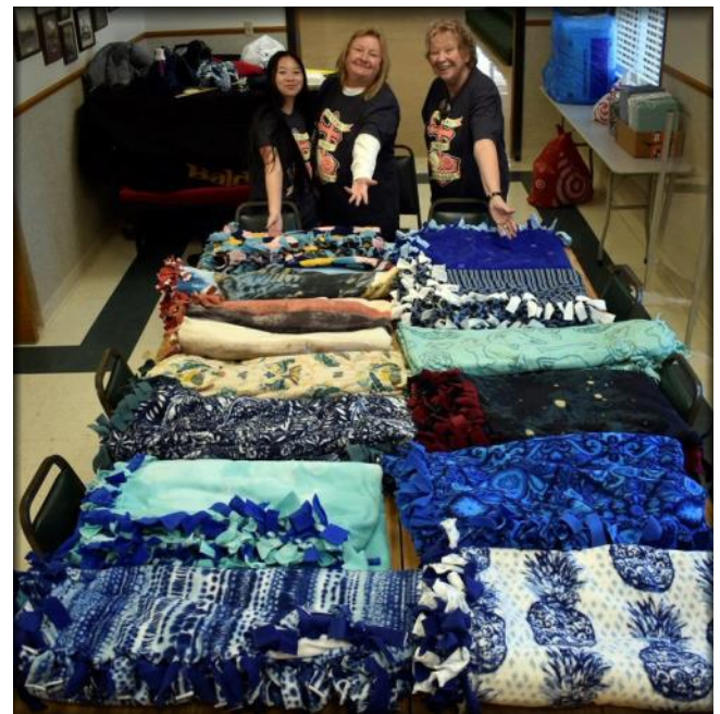
The Scandia Marine Lions Club tied 13 blankets for Solid Ground. Solid Ground helps people rebuild their lives after experiencing homelessness.