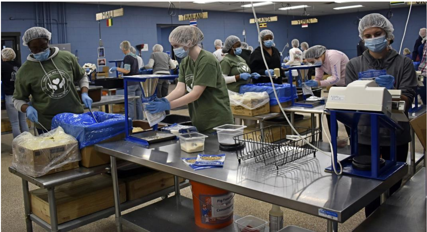
The Scandia-Marine Lions , family members, and friends packing food at Feed My Starving Children on the day after Thanksgiving.