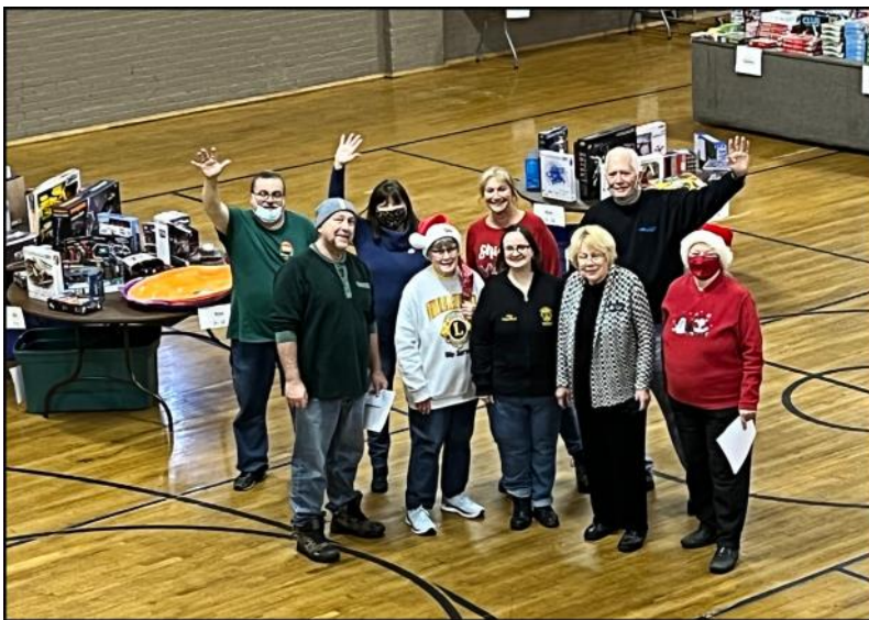
The White Bear Lake Lions Club have been providing toys and warm clothes to needy families for the past 20 years. This year, they served 47 families which equated to 131 children. The Club has been able to provide this service with the help of the Wildwood Lions, the American Legion, VFW and their Auxiliaries, the schools of 624 and the citizens of White Bear Lake.