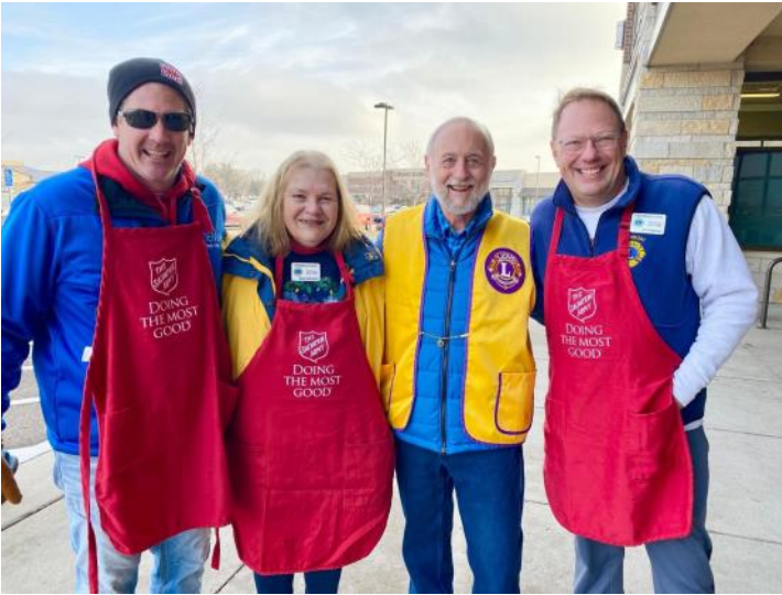
Woodbury Lions Club members ringing bells for the Salvation Army.