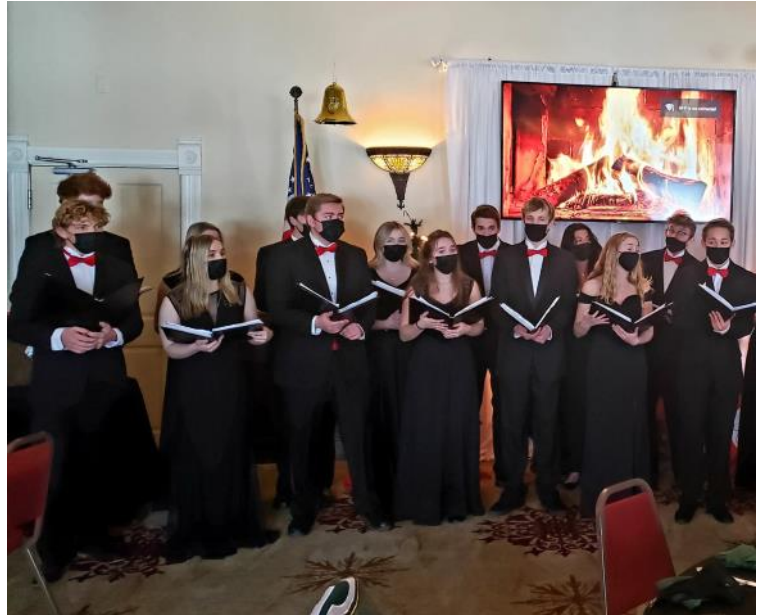
At the Stillwater Lions Club Christmas Party. Entertainment was provided by SAHS Vagabonds.