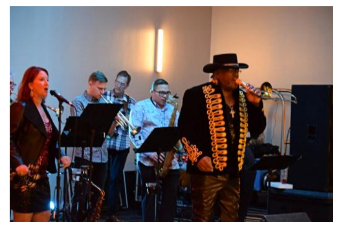
Friday night's entertainment was provided by Brass Menagerie.