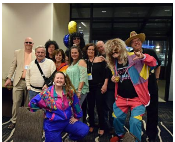
ABL Lions Club Members and friends. The ABL Club brought the largest number of members to the Convention. This picture was taken Saturday Night, just prior to the 80's Costume Contest.