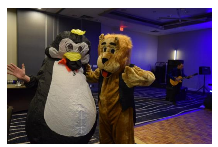
What's a Penguin and Lion doing on the Dance Floor?